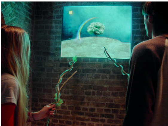
Figure 1: Two participants wielding magic wands in the WANDerful Alcove installation.

The WANDerful Alcove consists of two magic wands and a large projection of a story scene consisting of an elder tree in an enchanted landscape. The magic wands, initially sitting on small stands, are made from tree branches (as in The Lord of the Rings and Harry Potter ), and are decorated to enhance their magical quality as well as to hide the technology embedded within them. All of these elements exist within a controlled physical environment that is decorated and lit to further suggest an atmosphere of mysticism and to motivate passers-by to enter the space [Figure 1].