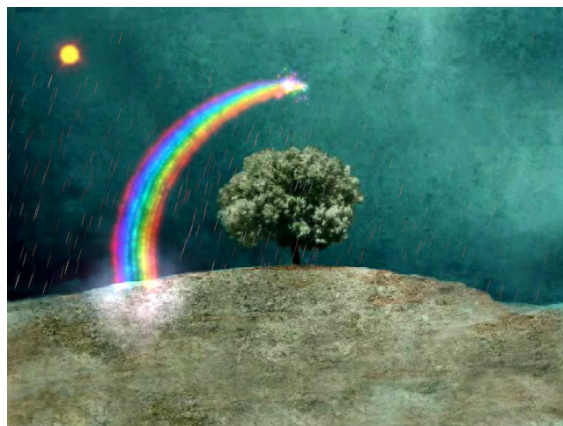
Figure 3. Participants who work together to summon the rain and the sun at the same time can make a rainbow.

Our first magic wand prototypes included simple tilt switches embedded in natural tree branches and required a small wire, made as inconspicuous as possible, to connect them to a computer running a gesture recognition algorithm to detect the rhythm of