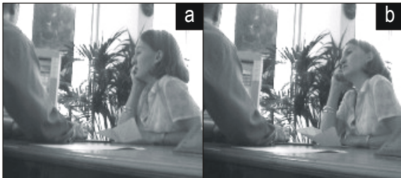
Figure 2: Aspects of the customer experience.

Another means of communicating face-to-face is gesture. Gesture can signal emphasis, hesitation, anxiety, satisfaction, and so on (Myers, 2000). It can also be used to point things out, or to ‘draw’ something ‘in the air’. Again, in the interactions we saw, this can become ambiguous. Agents may point and ‘draw’ on the basis of information they have, but the meaning of this may not be clear to the customer, as s/he does not have access to the same information. Equally, customers may produce meaningful gestures which are not being attended to because the agent is looking at the PC screen, e.g. , as in Figure 2 (a) and (b), the customer’s head-move to regain attention, as well as the (slightly perplexed) resting of the head in the hand.