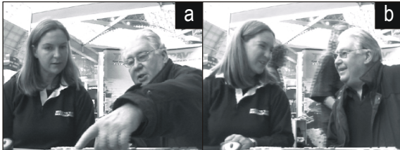
Figure 5: Part of the new user experience.

When agent and customer sat together side-by-side, rather than face-to-face, with shared representations to look at, they did not need to look directly at each other. This had a range of effects. What we found was that by improving content, the two parties immediately had a topic of discussion, and this acted as an ice-breaker. Gaze behaviour was less confused as well as more meaningful. We saw synchronization of gaze (Figure 5 (a)) as well as shared gaze shifts which were seamless – both parties appeared to know where to look.